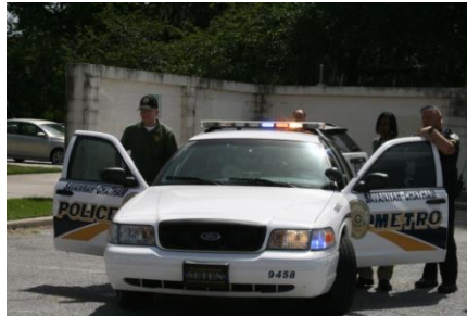
Explorers practicing traffic stops