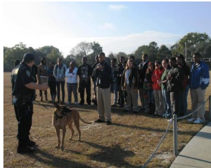
SCMPD K-9 demonstration